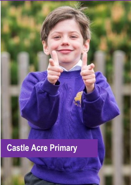
Castle Acre Primary